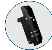
T100008B SRL / Hoist Bracket