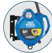
T410060 SRL Retrieval Single user with capacity up to 310 lbs.